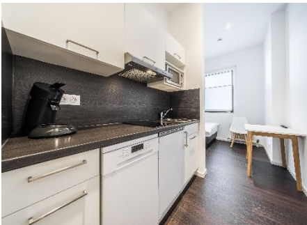
Single room standard