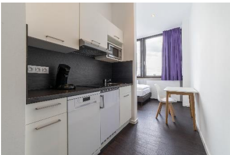
Single room comfort