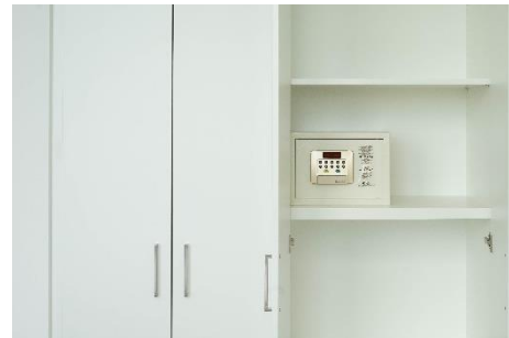
Cupboard with safe