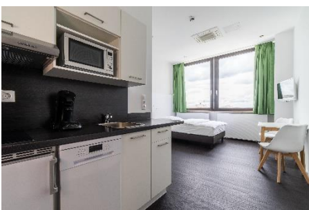
Single room Superior